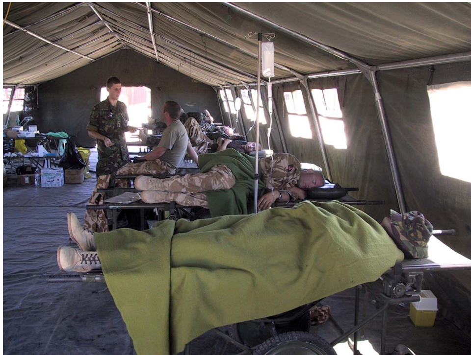
Figure 6 Isolation assessment area ('The Vomitorium') for a viral gastroenteritis outbreak during the Iraq War in 2003.

Defence Medical College at Gosport and then again to become the Royal Centre for Defence Medicine at Birmingham. The previous teaching for Army medical officers evolved to become a Military Infectious Diseases and Tropical Medicine Course for a tri-service and multi-disciplinary audience, but has been suspended since 2010 for administrative and financial reasons. The majority of Defence funding for microbiology and infectious diseases research is now given to civilian institutions who are unlikely to have the same priorities as military medical officers who specialise in these areas and see military patients on a regular basis. Recent changes to the funding of secondary healthcare for military personnel may further weaken the connections between military patients and military hospital specialists.