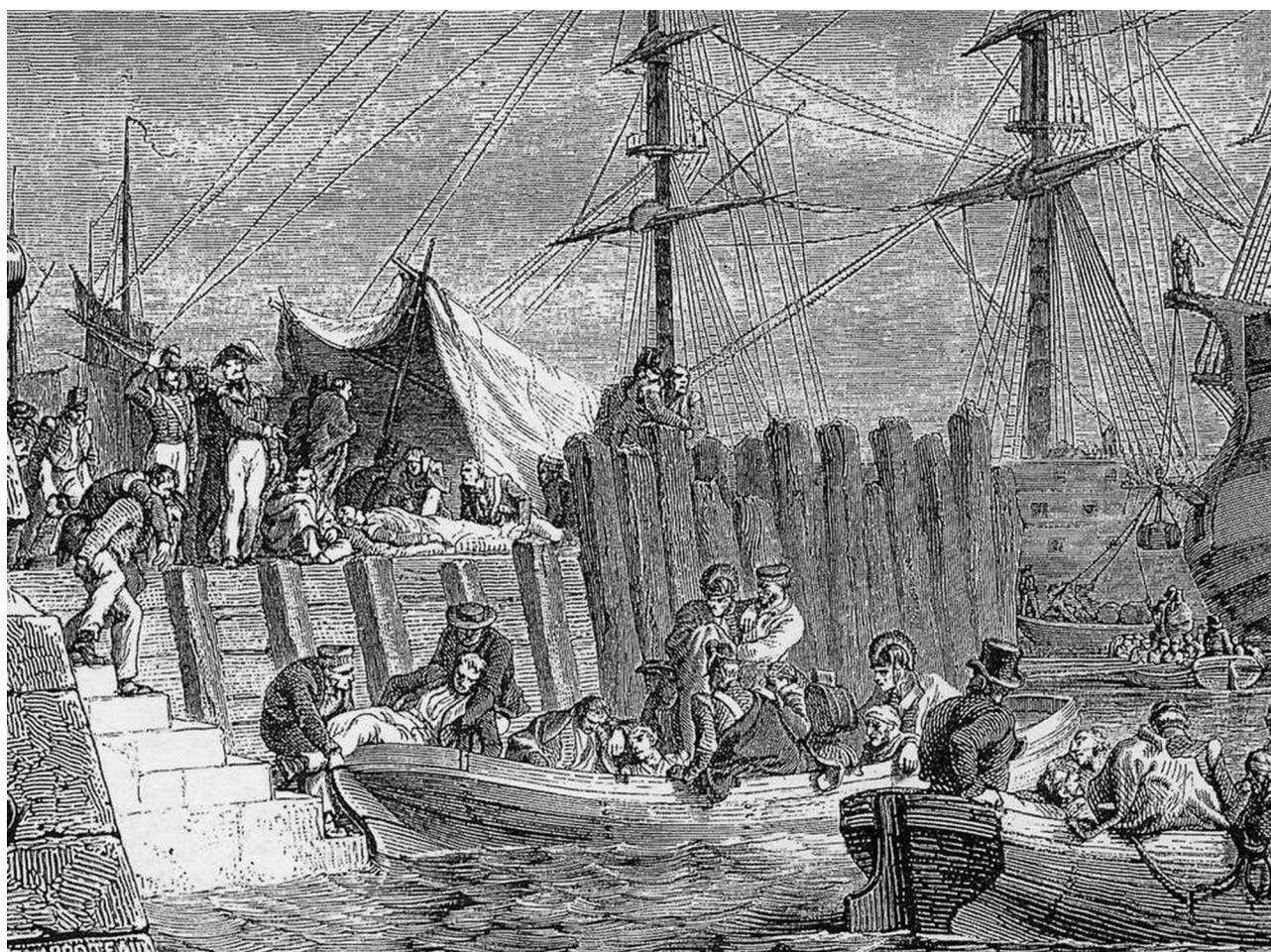
Figure 3 English troops with 'Walcheren Fever' being evacuated during the Napoleonic War in 1809.

preventative measures were attempted and medical reinforcements were called for, but none were available due to the demands of the Peninsular Campaign that was in progress at the same time. James McGrigor, who had just returned from being Inspector General of the medical services in the Iberian Peninsula, was dispatched in a similar role and after being shipwrecked en route made numerous organisational improvements. He also purchased a large quantity of cinchona bark (the source of quinine) from a passing American ship since this was known to be effective against certain febrile illnesses at the time.