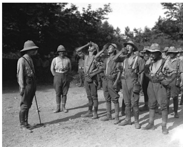
Figure 5 Malaria chemoprophylaxis parade at Salonika during the Great War in 1916.

Although infectious and tropical diseases now rarely cause deaths in British military personnel, they can still have a serious impact on operational effectiveness and military medical resources. 49 51 Infections such as Q fever and bacterial gastroenteritis can also have serious long-term sequelae that are not recognised by current data collection methods. Overall, a wide range of infectious and tropical diseases continue to be seen in British troops overseas and on their return to the UK. 57 However, this century has also seen a marked reduction in the facilities and other resources available for military teaching and research on these diseases. 58 The Royal Army Medical College at Millbank (now an art college) was downsized to become the Royal