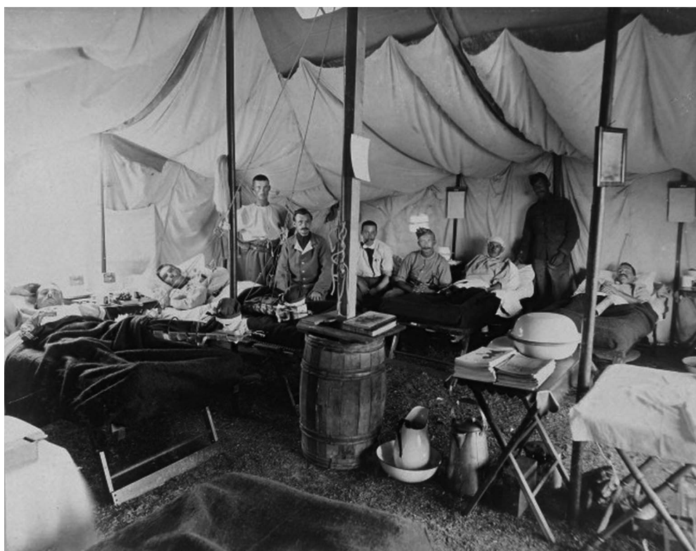
Figure 4 Interior of a field hospital with patients during the Boer War in 1900.

effective by RAMC medical officers in Malaya in 1955. 44 The first discovery of entero-toxigenic Escherichia coli (ETEC), which is the main cause of travellers' diarrhoea, was made in British troops in Aden in 1965. 45 Also most of the research on cutaneous leishmaniasis in Belize was conducted by RAMC medical officers in the 1990s. 46