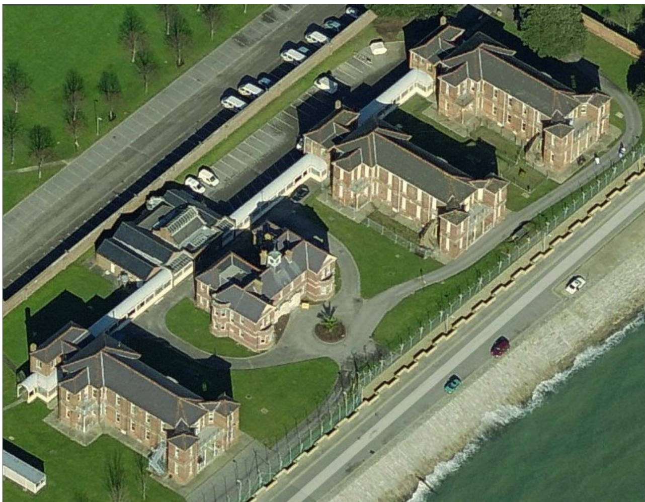
Figure 2 The 'new' Haslar Zymotic Hospital built from 1899 to 1902. It is now due for demolition.

(1707–1782), who made similar observations regarding infectious diseases in British Army camps and is often considered to be the father of military medicine. 10